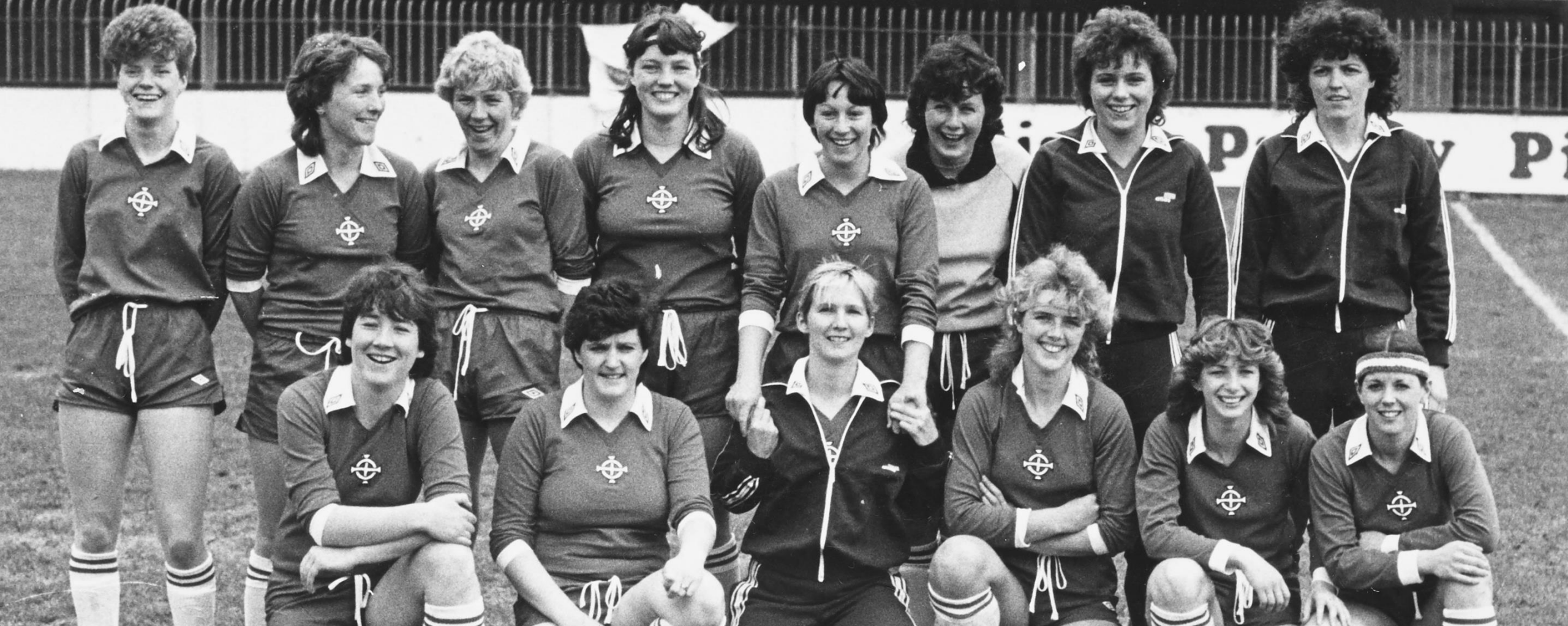
Northern Ireland Women's Football Association (D4673)